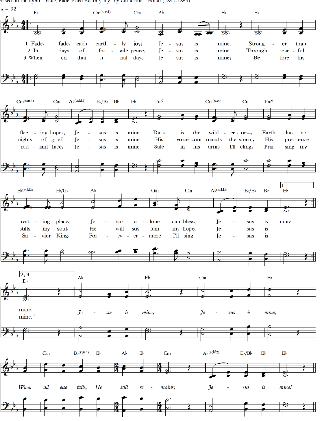
© 2018 Getty Music Publishing (BMI) / Matthew Merker Music (BMI) / Jordan Kauflin Music (BMI) (Admin. by musicservices.org) CCLI Song #7106791